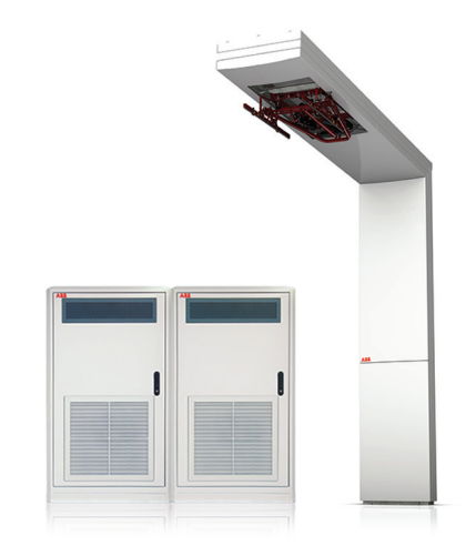
ABB Charger Care

With an ABB Charger Care service agreement matching the customer's needs, ABB can reduce the risk of unplanned downtime and rapidly respond if problems do occur.